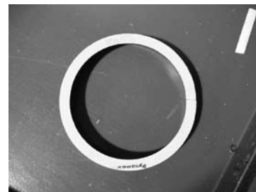
Yellow or ID groove around surface

Note: When replacing the fan drive, use the corresponding 1090-09500 in place of the obsolete 1090-08500 series fan drive.