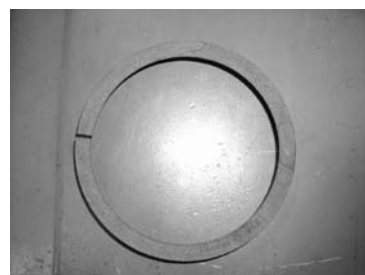
No color or ID groove around surface